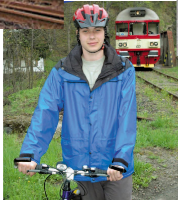
WORKSHOP: BETTER INTEGRATION OF REGIONAL RAIL AND GREENWAYS