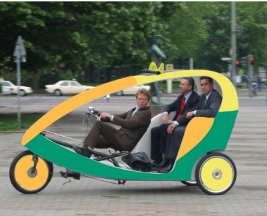
DEMONSTRATION: VELO TAXI AND OTHER CYCLE-POWERED VEHICLES

Participatory workshops, seminars, other educational events and entertainment for all ages and interest levels