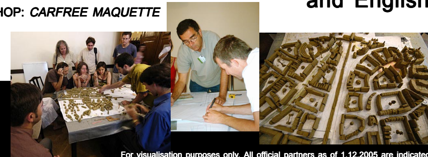
WORKSHOP: CARFREE MAQUETTE

For visualisation purposes only. All official partners as of 1.12.2005 are indicated.